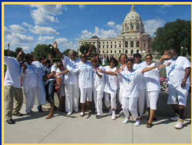
2012 - MINNEAPOLIS, MN