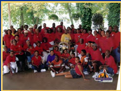
2005 - NASHVILLE, TN