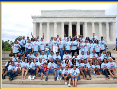
2010 - WASHINGTON, DC