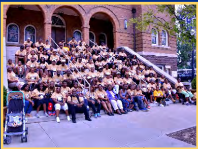
2014 - BIRMINGHAM, AL