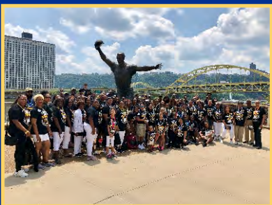
2018 - PITTSBURGH, PA