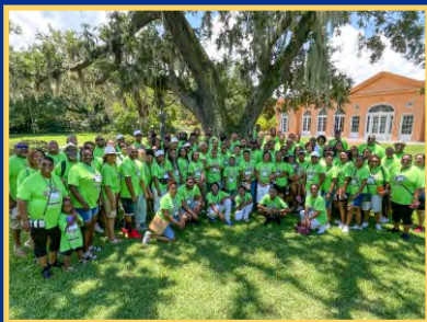
2022 - NEW ORLEANS, LA