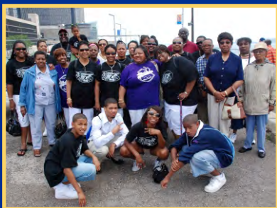
2007 - DETRIOT, MI