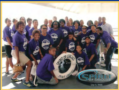
2006 - CHICAGO, IL