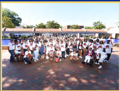
2024 - ATLANTA, GA