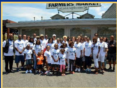
2016 - LOS ANGELES, CA