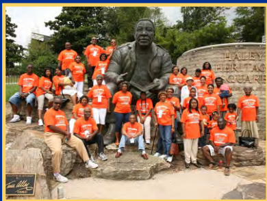
2009 - KNOXVILLE, TN