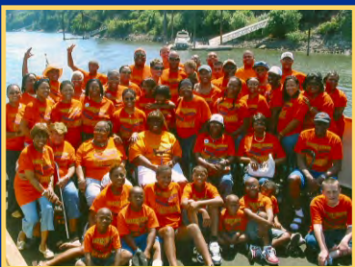
2008 - PORTLAND, OR